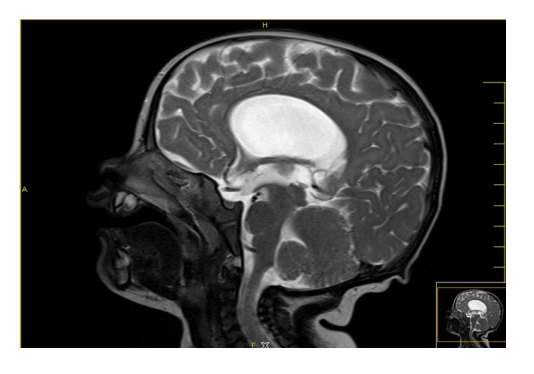
Fig 4:Sagittal MR image(T2 Weighted) showing thin corpus callosum.

5. Adibhatla RM, Hatcher JF. Tissue plasminogen activator (tPA) and matrix metalloproteinases in the pathogenesis of stroke: therapeutic strategies. CNS Neurol Disord Drug Targets 2008;7:243–53.