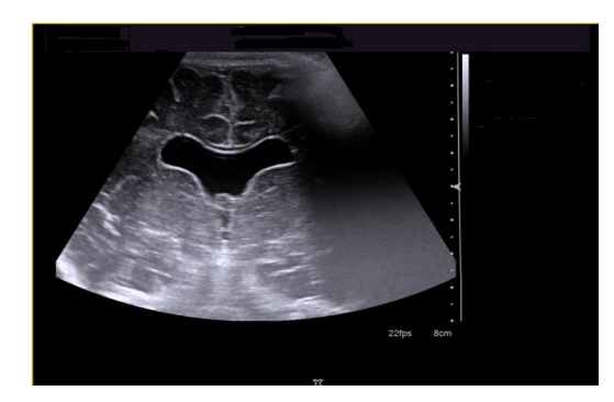
Fig 2: Neurosonogram showing fusion of frontal horns of both lateral ventricles with absent septum pellucidum.